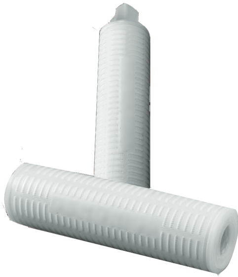
Figure 1 : Purtrex Depth Cartridge Filters